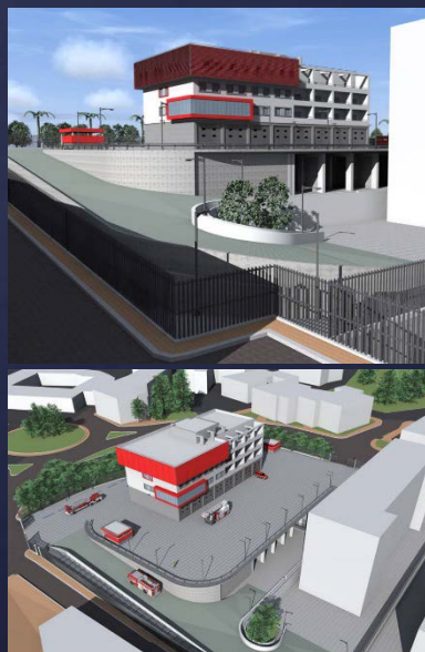
Fig. 1.4 - vista estrusa del modello di calcolo della autorimessa